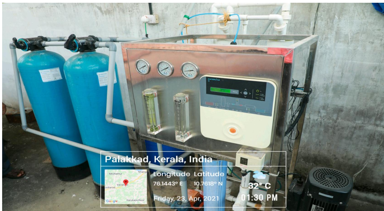
Reverse Osmosis Plant at Sreepathy- Purified Drinking Water