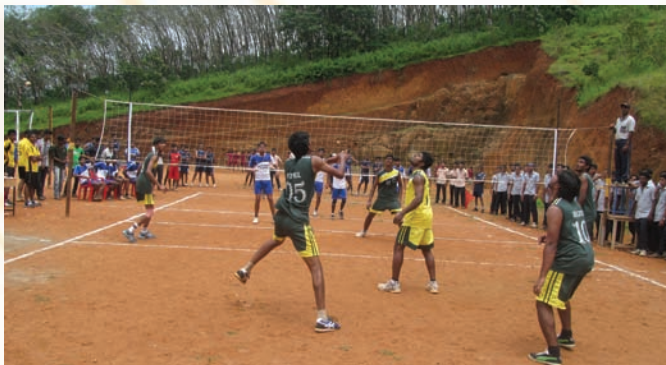
Volley Ball Tournament