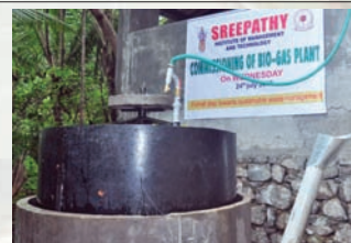
Bio gas plant

& Bio gas plant installed for waste management. The gas generated is utilised in the canteen.