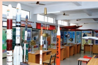
ISRO Exhibition Stall

Iconoclastz was conducted by Electrical Dept. which exhibited a presentation and display of electrical commodities and