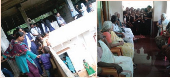
Sreepathy students at various Charitable Organisations