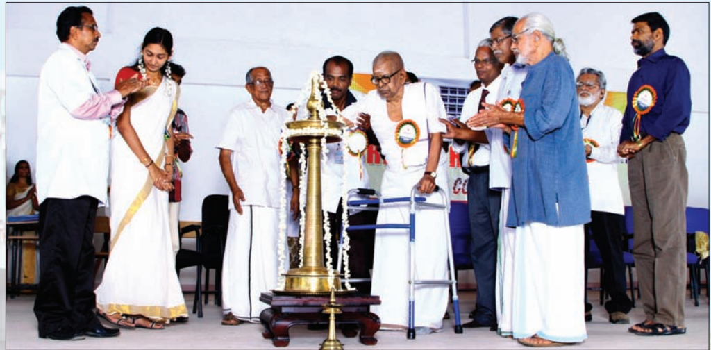
Mahakavi Akkitham Achuthan Namboodiri inaugurating the course completion ceremony 2013

“In this best of possible world all is for the best” -VOLTAIRE (1694 -1778)