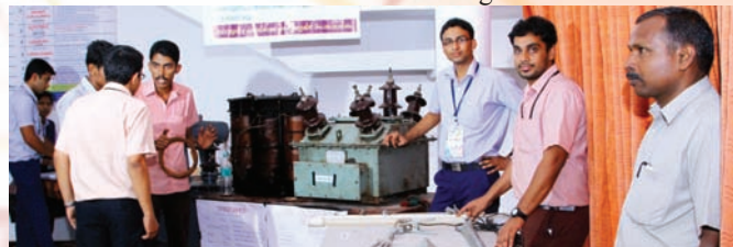
KSEB Exhibition Stall

Winding up of this 2 day event was done by distributing the prizes and Certificates by the Principal. He appreciated all students who worked behind to make this function successful and congratulated the winners.