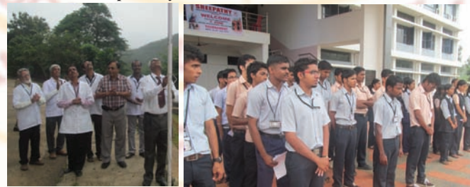
Inaugural session of NSS Day

NOT ME, BUT YOU, motto of NSS, reflects the essence of democratic living and upholds the need for selfless service and appreciation of the other person's point of view and also to show consideration for fellow human beings. It should be the aim of NSS to demonstrate this