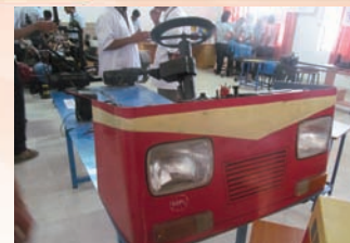
KSRTC Exhibition Stall

and exhibitions attracted so many students from other colleges and schools as well. This response from the part of audience was enough to indicate how successful this Technical Festival was.