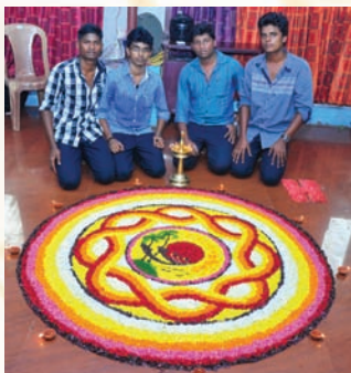
SIMAT team in Appollo Gold pookkalam

The S4 students of Civil Department of Sreepathy