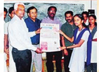
Inaugurating the program by handing over News Paper