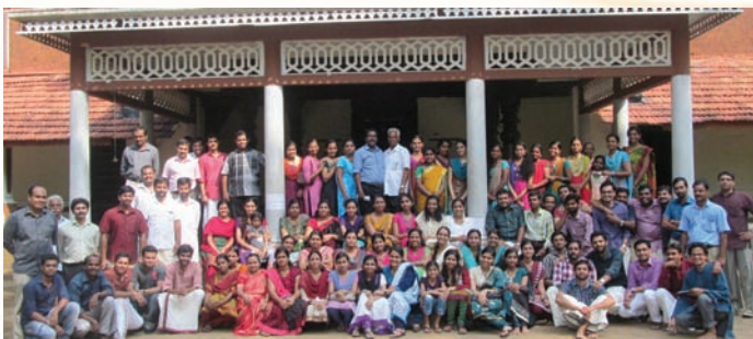
Staff members at Varikkassery Mana