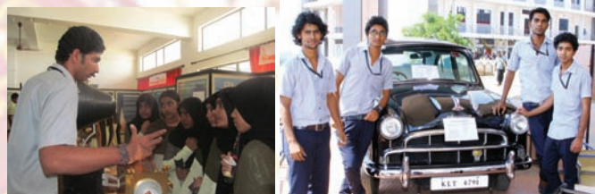
Exhibition by Students