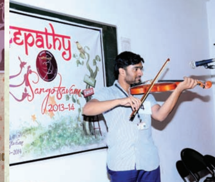
Stills from Sargotsavam