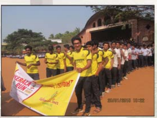
From Run Kerala Run

Run Kerala Run was organised on 20/01/2015 to express the state's unity and solidarity with the National Games, being hosted by Kerala after an interval of 27 years. Students of Sreepathy Institute of Management and Technology participated in the programme. 120 students of SIMAT managed to run a stretch of 3.5 KMs from Vattenad to campus.