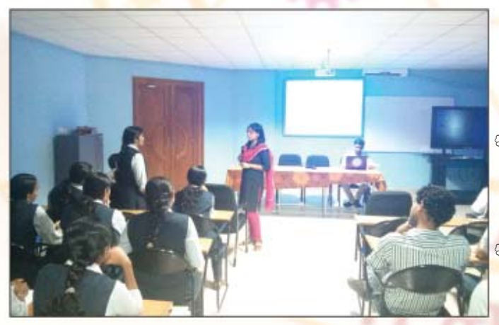
From the campus recuritment drive

Focus Academy for Career Enhancement (FACE) conducted a campus recruitment drive at SIMAT for the post of Junior Trainer on 6/12/2014. 51 students in total participated in