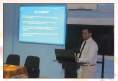
From the campus recruitment drive of UIT Group of Companies

UIT Group of Companies conducted a campus recruitment drive at SIMAT