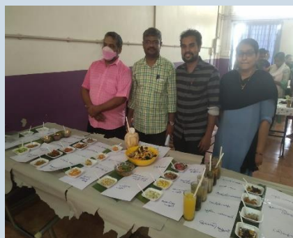
First Prize: Team Thehnnilavu

and a time of 3 hrs was given to each team to prepare their dishes. The event was conducted in the canteen area. The guidelines as to what are permitted and what is not to be done were outlined by the organisers on the previous day of the event to the team representatives.