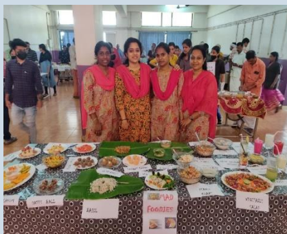
Second Prize: Team Mad Foodies