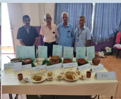
Third Prize: Team SS Jn